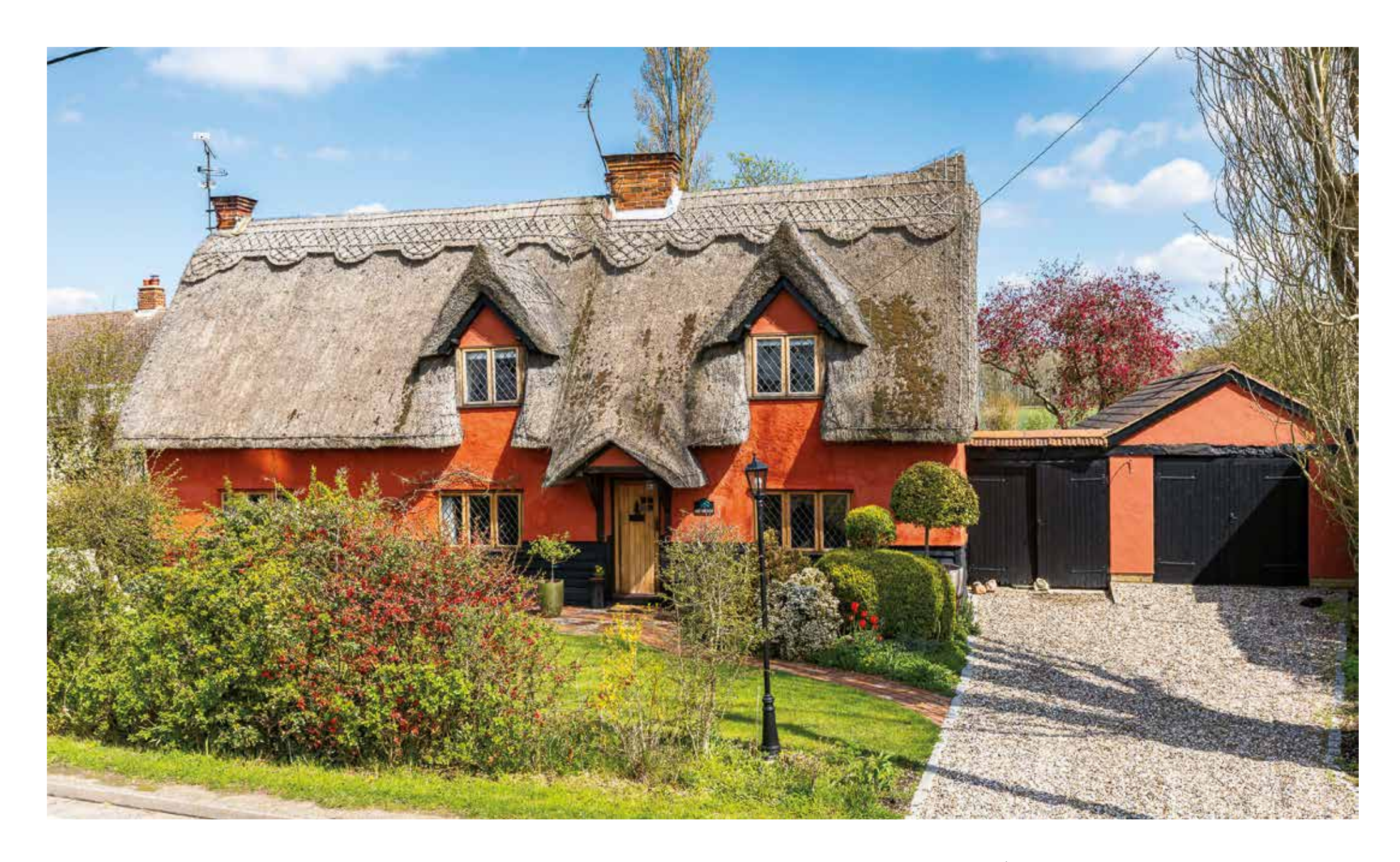
Oak Cottage Willows Green | Chelmsford | Essex | CM3 1QB